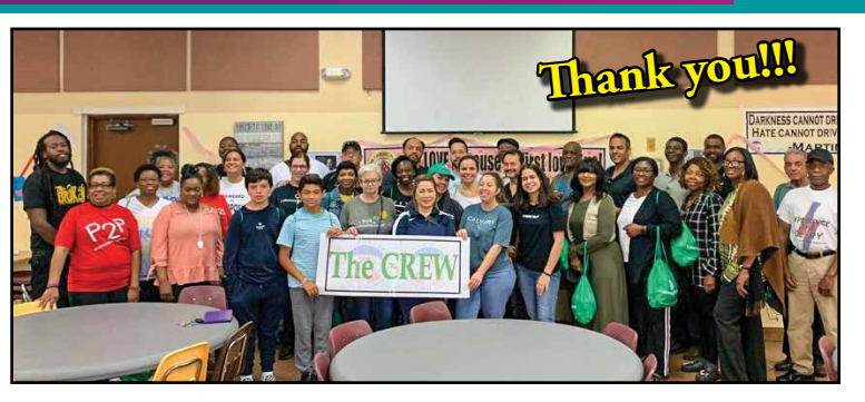
Broward Outreach Center CREW evangelizing group - caringplace.org/faith