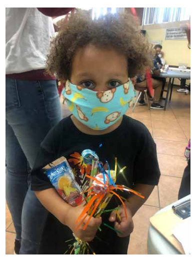
Passover and Easter were celebrated, but we did not have our normal giant block outreach. Everyone received special gifts and opportunities to worship.