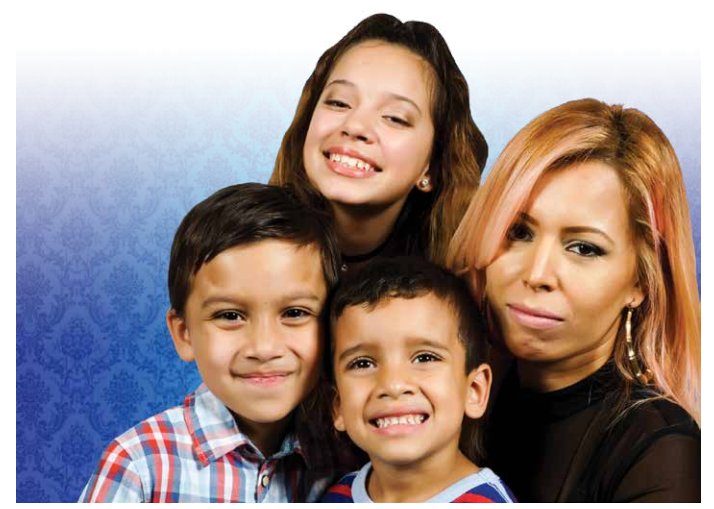
We will be having special Mother's Day Celebrations and doing so with safety and proper precautions. What very difficult times for our families.