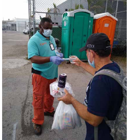
We have been able to pass out masks and food to the unsheltered. There are also sanitizing stations available. We will be slowly opening our doors as soon as it becomes feasible and safer.