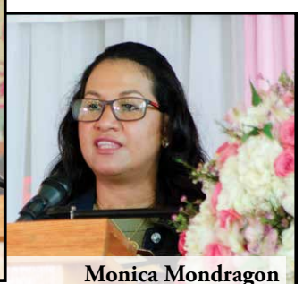
Ordained Minister & Keynote Speaker