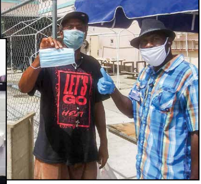
In abundance of caution, our Centers continue to pass out masks to residents and unsheltered guests.