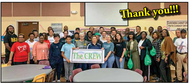
Broward Outreach Center CREW evangelizing group - caringplace.org/faith