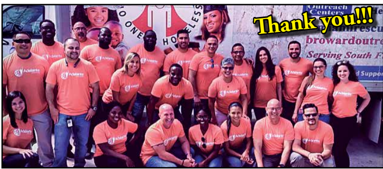
Group from Pepsi & Frito Lays volunteered in the kitchen in Miami.

Visit www.caringplace.org/volunteer to find out how you can volunteer!